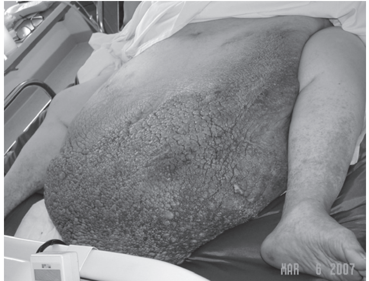
A patient who weighs over 500 lbs and has a pannus which drags the ground when he attempts to ambulate. Note the "cobblestone" changes from inflammation (lymphedema of the abdomen) and hemosiderin deposits ("venous stasis" like changes) which have occurred as a result of chronic dependency of his pannus. The pannus is estimated to weigh over 150 lbs.

Patient #2 increased his weight from 500 to 530 lbs over the course of treatment with a resulting 10,000 cc increase in volume of the affected extremity. The third patient decreased his weight from 404 to 381 lbs and noted a 23% decrease in limb volume (5,000 cc). In general, we have found that patients who gain weight respond poorly to treatment and those who do not gain, or preferably lose weight, achieve benefit.